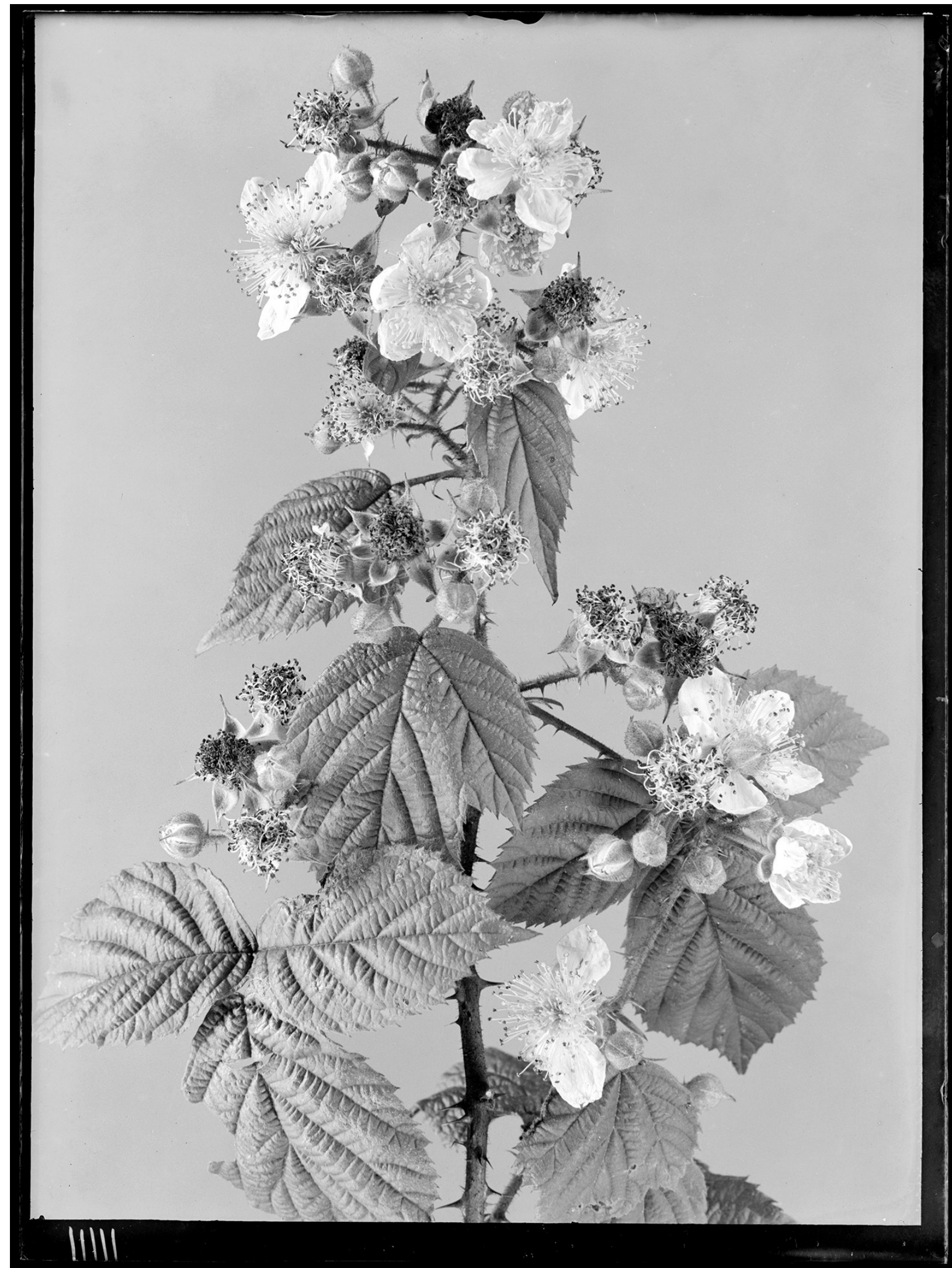
Record number: HASMG:2023.113.31

2/8/04 Rubus dumetorum N o 11111 var. diversifolius Lindl (N o Beaufort Park